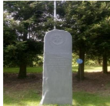
Rotary International Memorial

A quick break to friends in Shorpsre gave us the opportunity to visit the Arboretum in Staffordshire. Beautiful, peaceful surrounding gives time to enjoy and reflect the memorials displayed around this 150 acre site with over 25,000 trees and over 400 memorials.